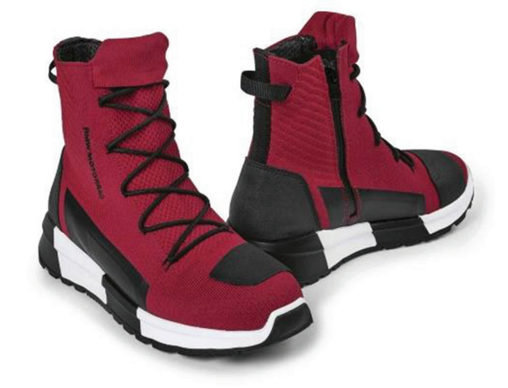
KniteLite Sneaker (women)