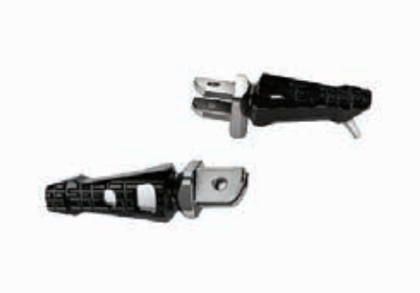
Milled foot pegs