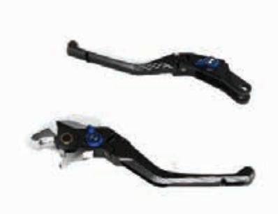
Milled, foldable handbrake lever / clutch lever