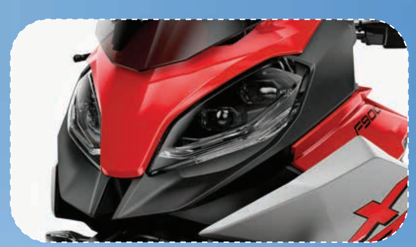
Auxiliary LED Lights